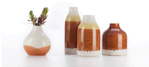
Baco & Sidney | Reactive Orange Glazes