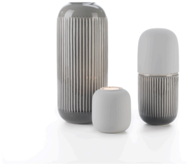
Capsule | With Relief

Product lines designed within this duality of past versus future.