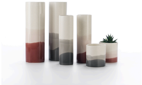
Comfort | Tubular Vases with Multi-Dip Adonis | Regular Glazes