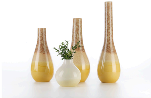
Zulu | Mix of Reactive Glazes