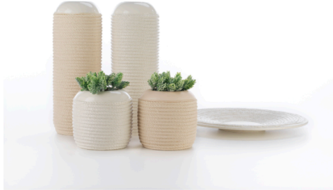
Rope | Embossed Relief