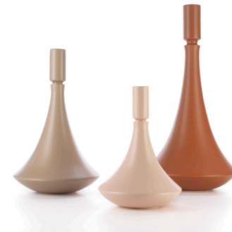
Ballet | Matte Apricot, Terracotta & Pink