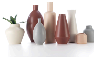
Family | Matte Glazes