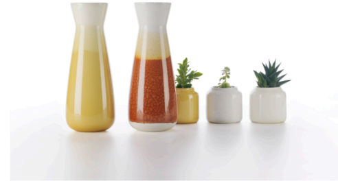
Family | Reactive Glazes