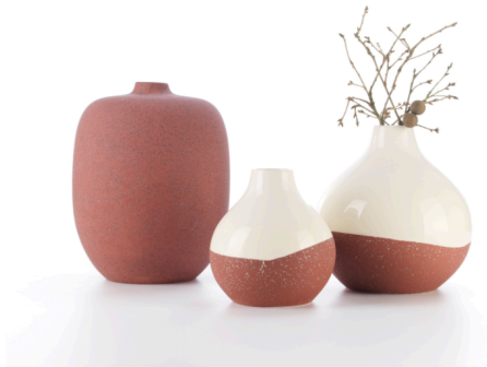
Vintage & Sidey | Slip Glaze in Total or Partial Dip