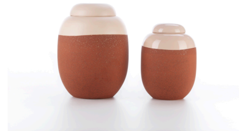
Vintage Pot | Pink Glaze and Terracotta Slip