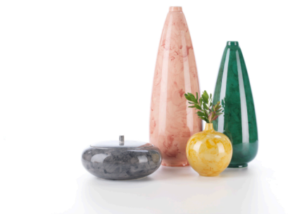
Singapore | Abstract Hand Painted Technique