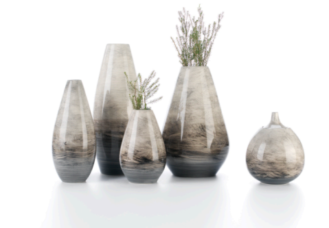
Bowling | Abstract Hand Painting