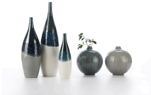
Alpes | Reactive Glazes