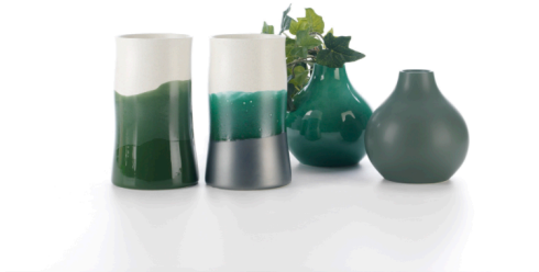
Craft & Sidney | Glazes in Multi-Dip