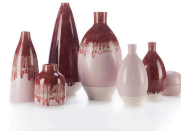
Family | Reactive Glazes