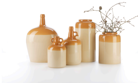
Makalu & Povinho | Glossy Apricot