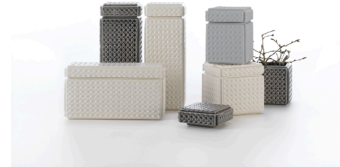
Lace Boxes | White Glaze and Grey Slip