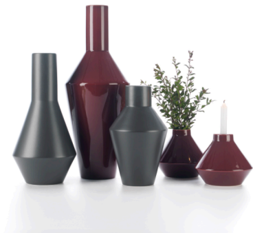
Canecos | Glossy Glaze with Speckles