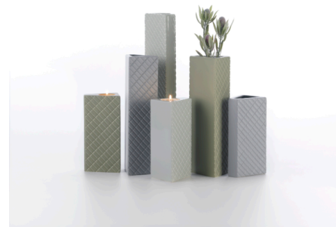
Metropolis | Matching Tubes in Regular Glaze