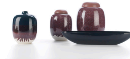
Vintage Pot | Running Reactive Glazes