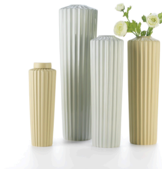
Adonis | Regular Glazes