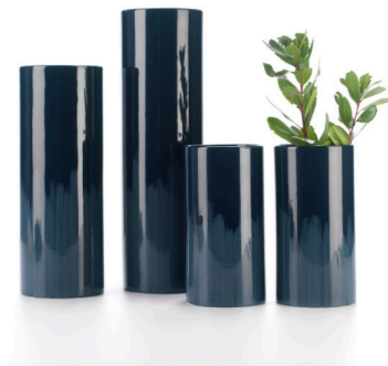
Plain | Brushed Effect