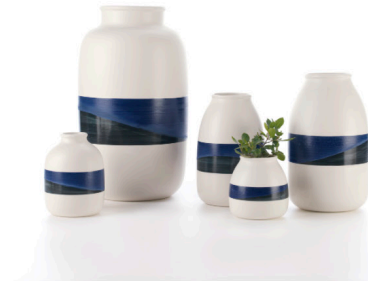
Eclectic | Biscuit with Hand Painted Band