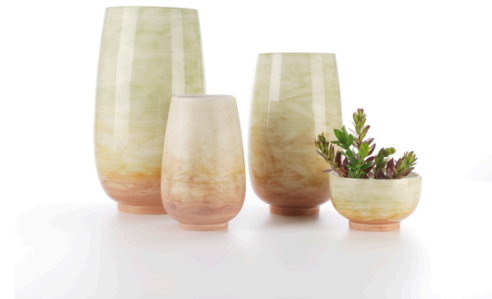
Heaven | Abstract Hand Painted Technique