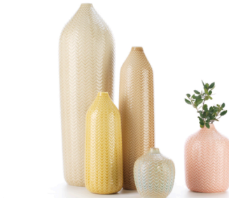
Zig-Zag | Embossed Chevron Pattern