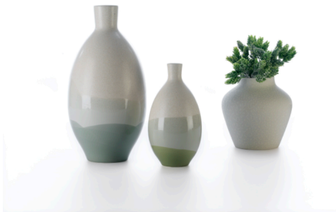
Family | Dip technique