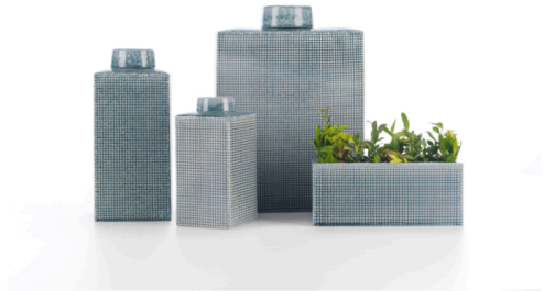
Doha | Reactive Blue Ash in Textured Surface