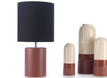
Kenya & Lamp | Mix of Matte Glaze with Glossy Dip