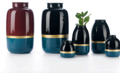
Eclectic | Cold Painting Gold Stripe