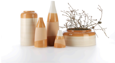
Piana & Makalu | Glossy and Matte Apricot Glazes