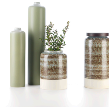
Makalu | Vases with Dark Wood lid