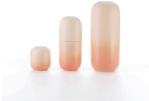
Capsule | Plain with Gradient Glaze