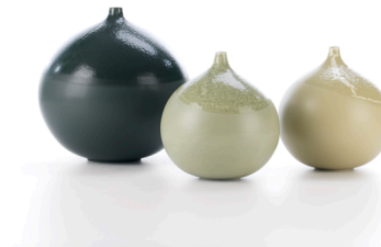
Apple | Rounded Shape with Reactive Dip