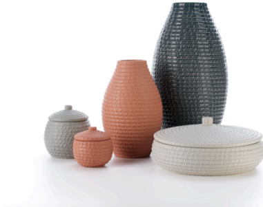
Morocco | Matte Solid Glaze