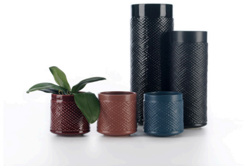
Refresh | Tubular Vases with Relief